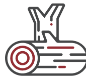
Logs & Tree Bark